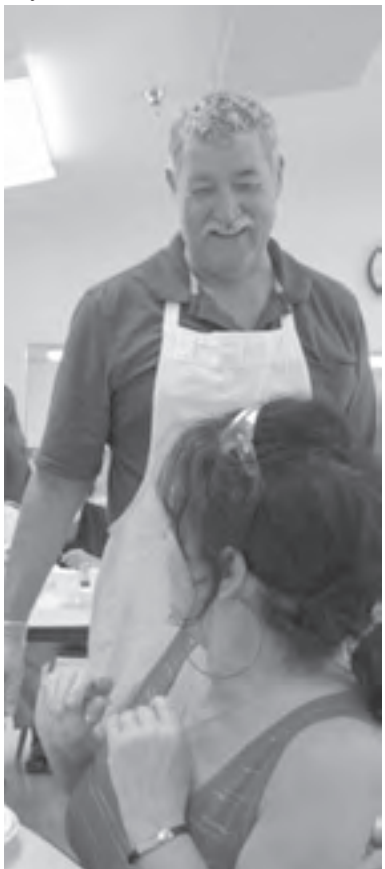
Elders are served with style at the annual Unit I elders picnic.