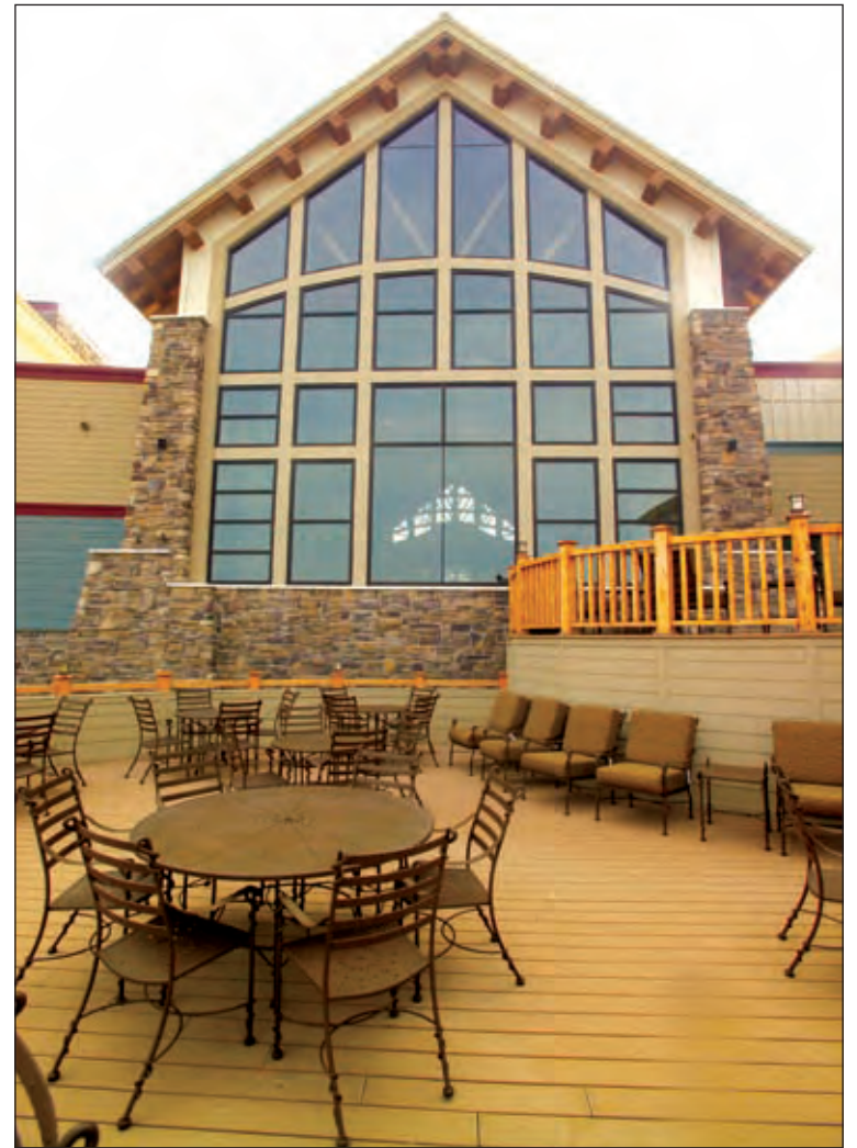
A two-tiered deck attached to the rear of the casino, overlooks Horseshoe Bay, offering a spectacular area for visitors.