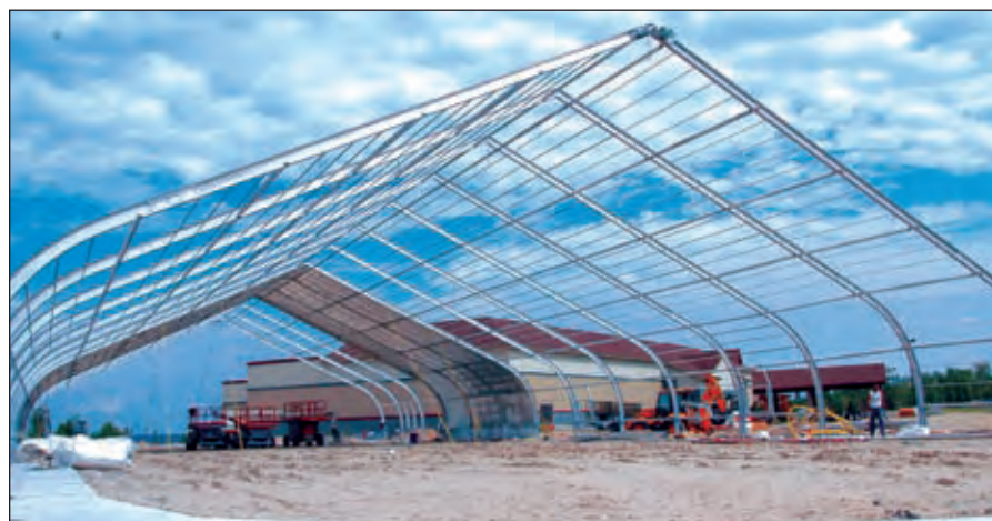
The new casino. The frame was erected in June of this year to enclose the new 25,650 square foot gaming hall.