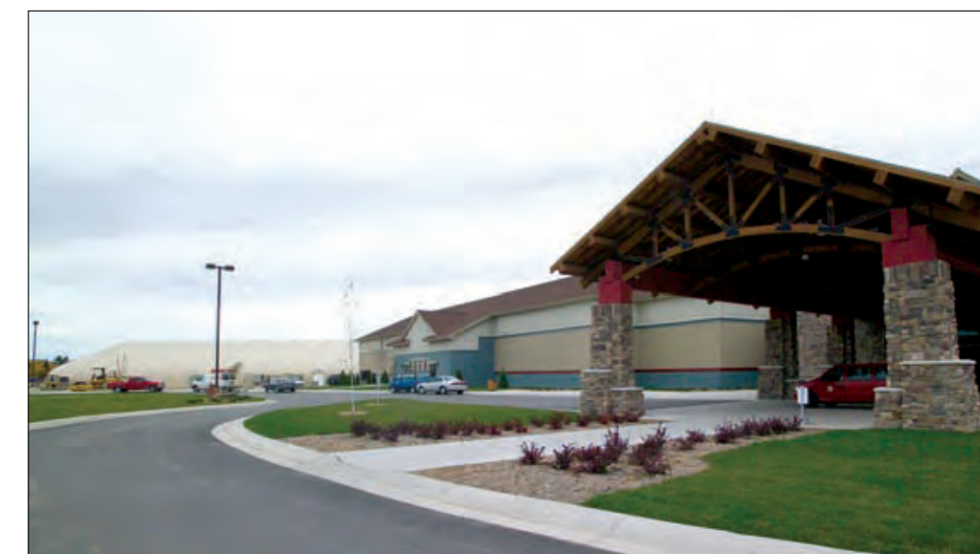
The new Kewadin Shores casino sits on the north side of the hotel, left in photo, and entertainment complex, ( at left in photo).

“We want to give our congratulations to Kewadin Shores Casino and wish you the very best”