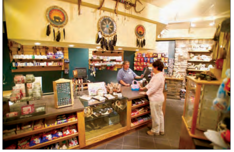
The Eagle Feather Gift Shop, located to the left of the casino entrance, offers guests a variety of unique gifts, hand crafted items and snacks. Be sure to stop in during your visit to the casino! A beautiful view of Horseshoe Bay and Lake Huron is there for the looking from the deck, restaurant, Whitetail Bar and rooms on the east side of the hotel.