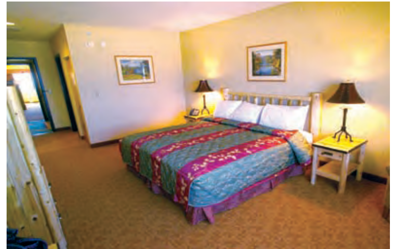
One of the 81 new rooms featured at the Eastern Upper Peninsula's newest attraction.

We would like to compliment Kewadin Shores on the wonderful new casino in St. Ignace, We Think It is Awesome