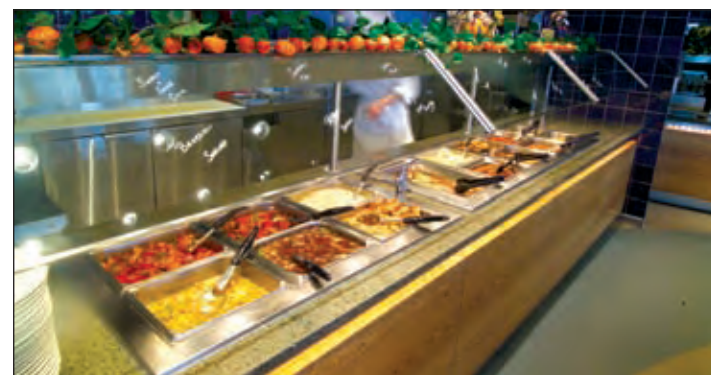
The buffet at the Horseshoe Bay restaurant starts out with on site prepared oriental foods and moves around the globe to Mexican, Italian and local dishes.