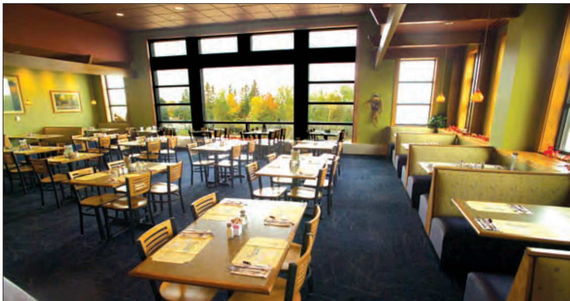
Kewadin Shores Casino and Hotel offers a full range of dining pleasures that are sure to satisfy the hunger of the traveling gourmets. The Horseshoe Bay Restaurant, above, offers a multi-cuisine buffet for breakfast, lunch and dinner and a full menu. The buffet, below, features action stations and a multitude of choices sure to please even the pickiest eater.