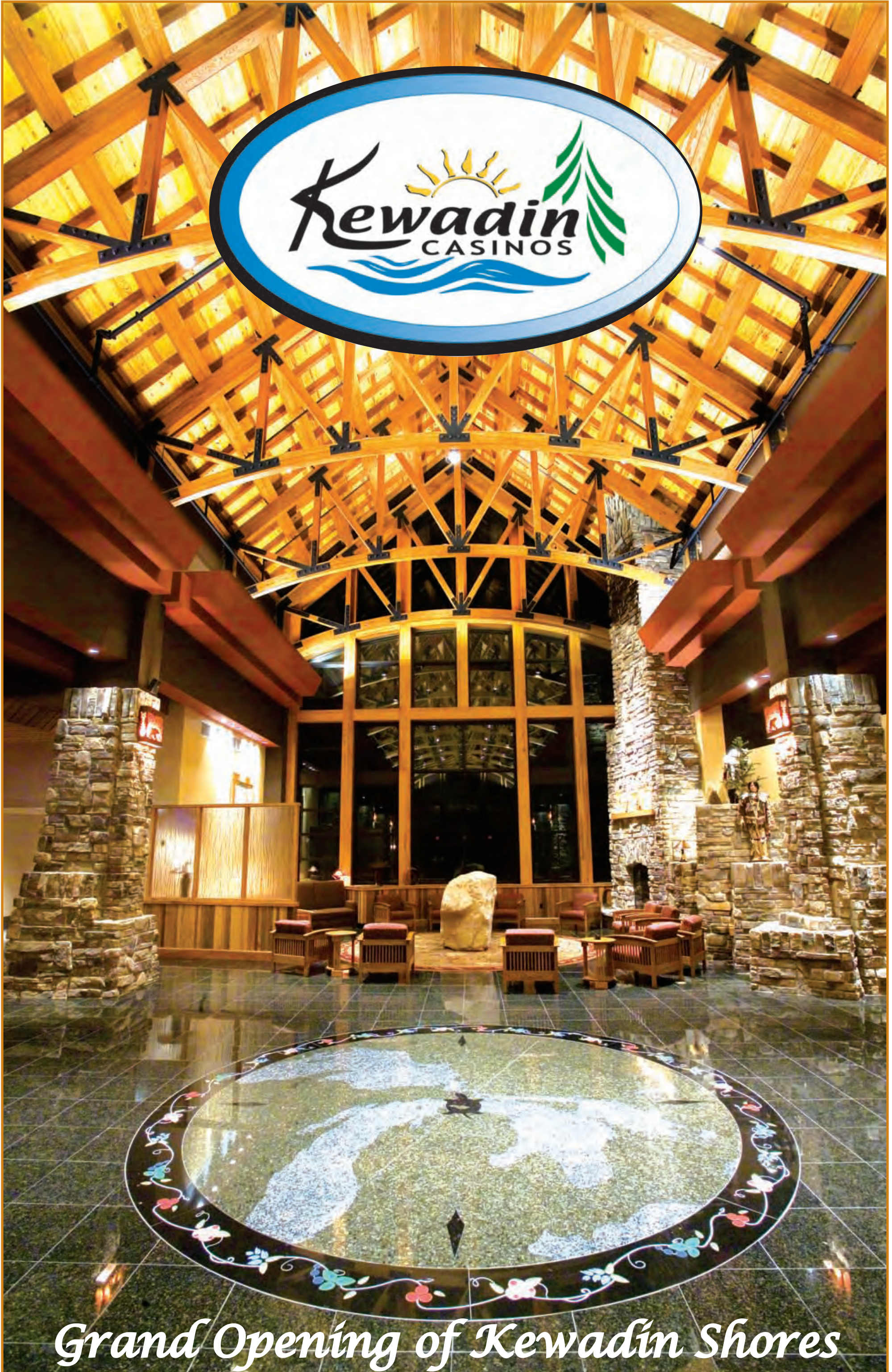
Grand Opening of Kewadin Shores