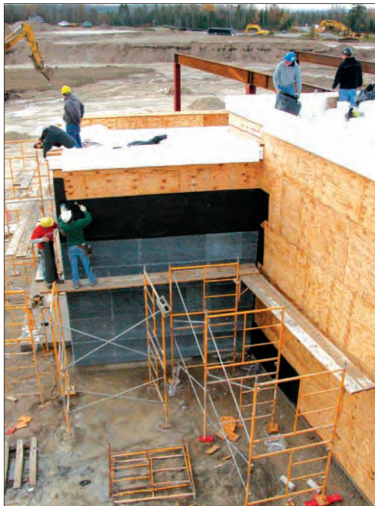
Siding attached. Workers attached the siding and insulation to the complex. Almost 80 percent of the 500 construction workers who worked at the site were local residents from the over 40 subcontractors who participated in the construction of Kewadin Shores Casino and Hotel.