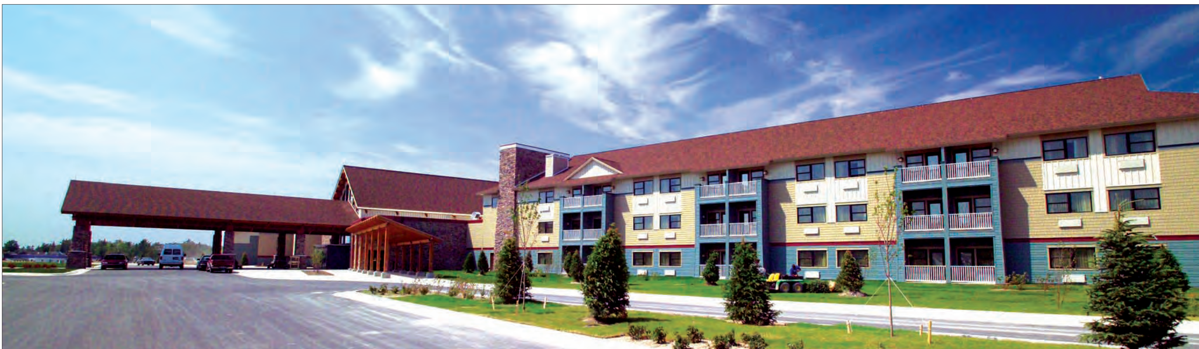
Kewadin Shores Casino and Hotel sits on a small hilltop overlooking Horseshoe Bay and has 81 rooms, a conference room, breakfast nook, 225 seat restaurant, gift shop, deli, two bars, a workout room, game room and swimming pool.