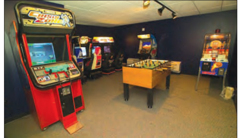
A full action game room, above, and a fully equipped work out room, below, are available at the hotel for guest use.