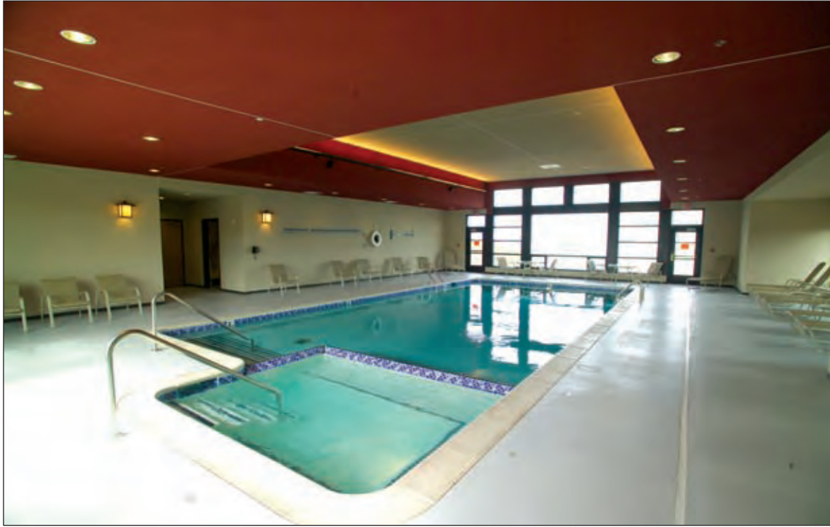
A year round pool and whirlpool which overlooks beautiful Horseshoe Bay is the perfect spot to relax after a day of gaming excitement.