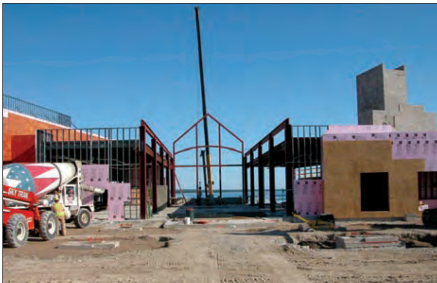
A crane raises the window frame to the rear of the lobby which overlooks Horseshoe Bay. The casino, entertainment room and restaurant are on the left with the hotel complex and lobby on the right.