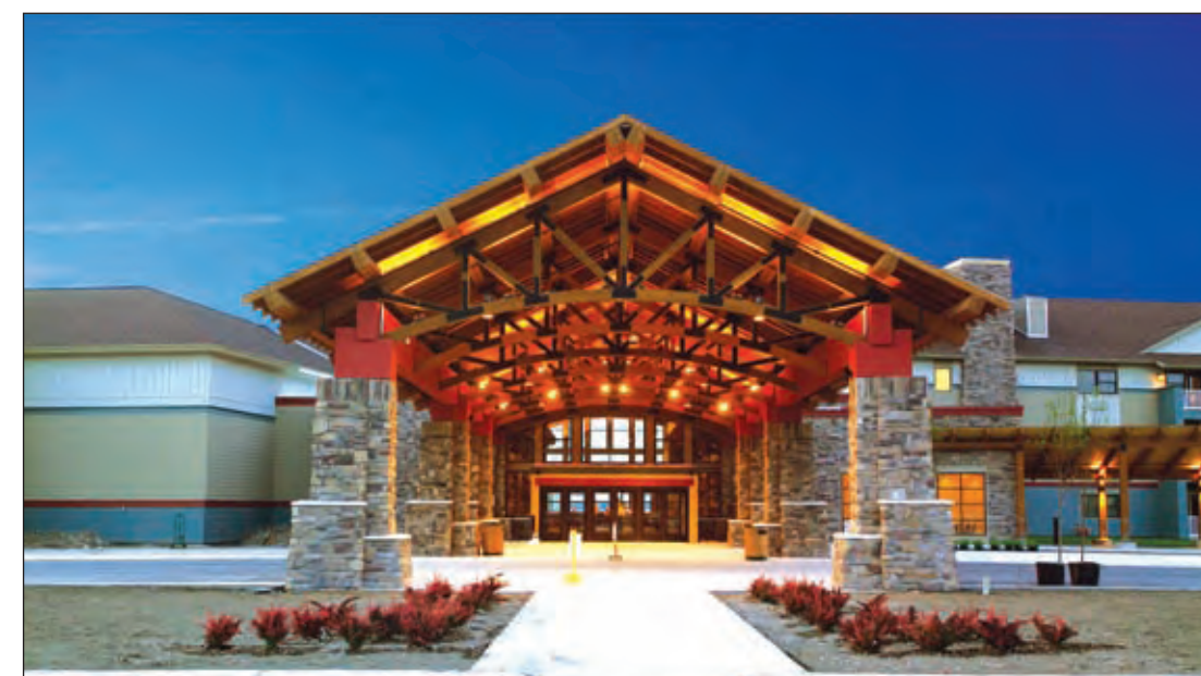
The main entrance to Kewadin Shores.