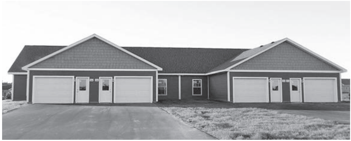
An ADA/handicapped accessible elder quad unit, above, was recently completed and ready for occupants. Sault Tribe's Force Account construction crew, below, working on one of the new homes.

On Jan. 3, 2023, the Sault Tribe Board of Directors passed Resolution 2023-024 placing the management of the Odenaang Homes Tribal Enterprise under the Sault Tribe Housing Authority. There are currently 20 modular homes that are going in on the Odenaang Housing Site that are under this enterprise that was created with the ARPA Funds. The first 14 units are being set. The engineering for the utilities for those units and the location of the other six units is being completed and that project will be put out for bids soon. The goal is to have all 20 units ready for occupancy in late 2023, pending construc-