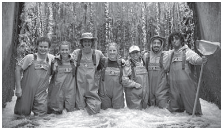
The tribe will be welcoming a second AmeriCorps NCCC team towards the end of June to continue the work begun by last year's team to completely interrupt the wild parsnip growth cycle on the south side of the Odenaang housing complex. Shown above is the 2022 NCCC team.

Additional invasive species removals will include European frog-bit, purple loosestrife, narrowleaf cattail, and spotted knapweed along with community development projects such as repairing the Environmental Department's greenhouse and