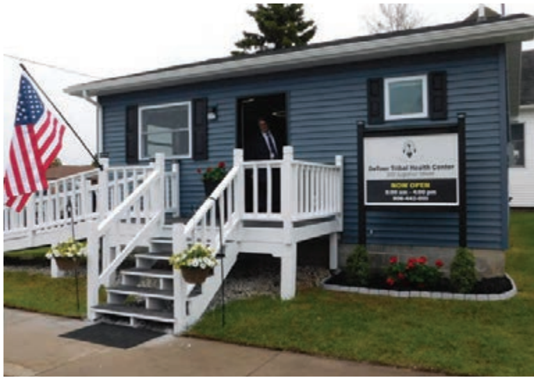
This former beauty salon, located at 200 St. Mary's Street in DeTour Village, has been converted to the DeTour Tribal Health Center which officially opened on May 19.