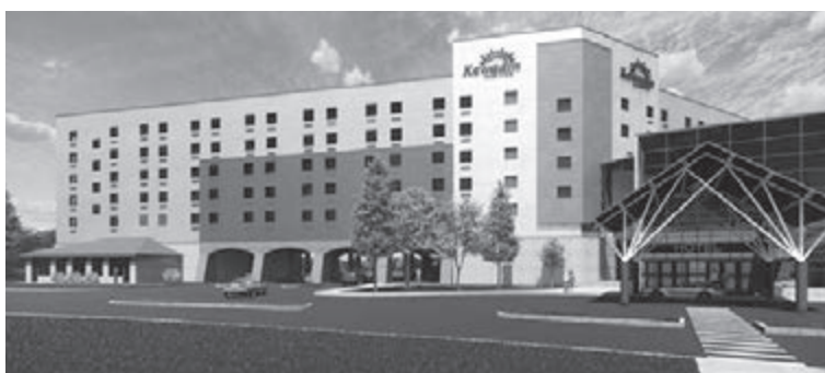
Artist renderings of the front (above) and back of the casino upgrades.

Located in one of the most scenic regions of North America, Kewadin Casinos offers over 2,000 slot machines, 26 table games, hotels, dining, and other amenities at five properties in Michigan’s eastern and central Upper Peninsula. Owned and operated by the Sault Ste. Marie Tribe of Chippewa Indians, Kewadin Casinos are the premier gaming destinations for people who live in and visit the Upper Peninsula, which is bordered on the south by Lake Michigan and Lake Huron, on the west by Wisconsin, and on the north by