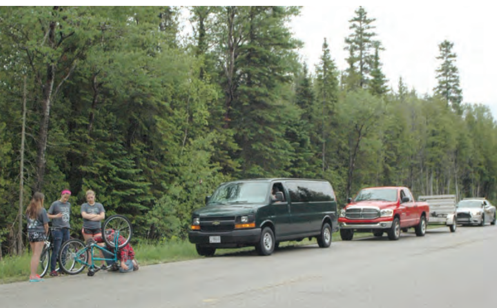
One of the support escorts repairs a disabled bicycle as the rider and friends standby. One Sault Tribe police escort stayed on scene with the delayed group while another continued on with the other riders.