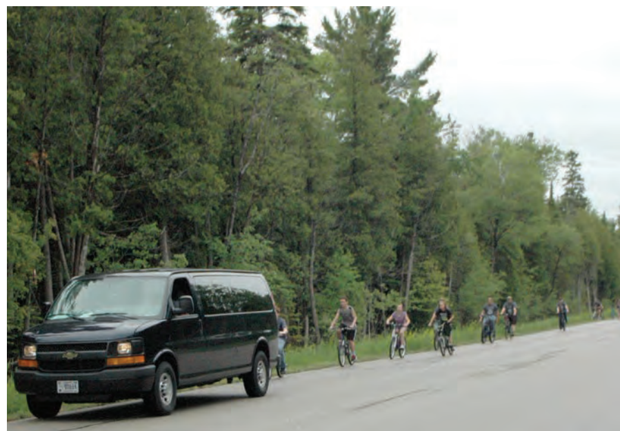
A support van follows an (unseen in the photo) a Mackinac County Sheriff's escort and leads the line of riders along Mackinaw Trail (H-63) heading to Sault Ste. Marie.