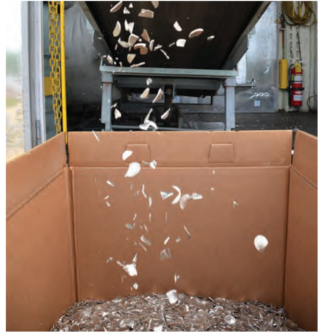
Tokens being "chewed" up into small pieces.