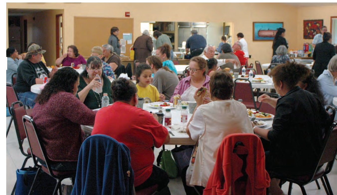
More folks enjoying lunch between workshops at the Niigaanagizhik Ceremonial Building during the conference.