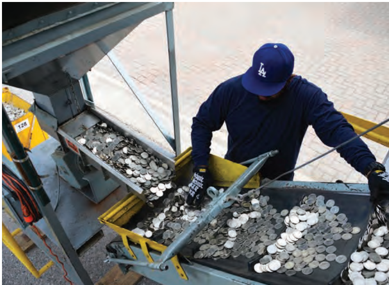
Above, a worker from Secure Mobile Destruction checks the conveyor belt. Below, Secure Mobile Destruction in action next to the Sault casino.