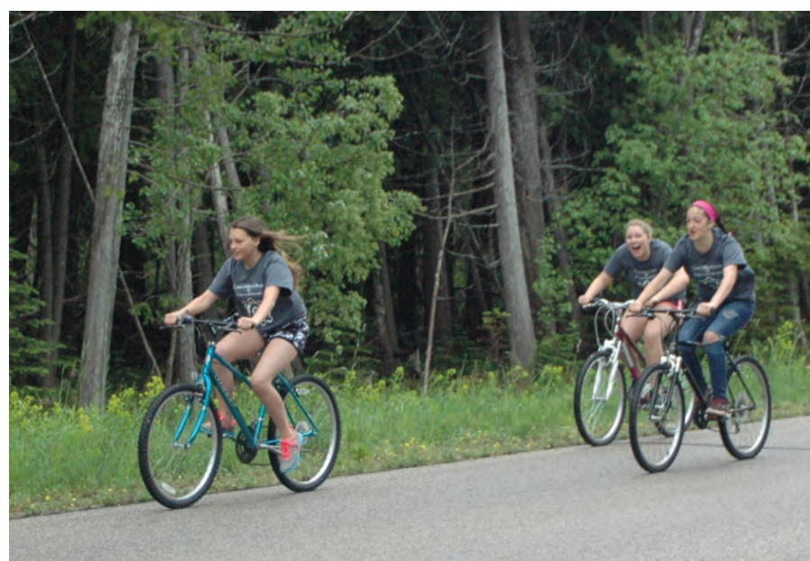
With the repair soon completed, the delayed riders race to catch the rest of the group.