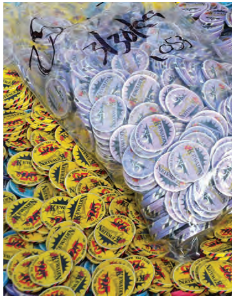
Discontinued playing chips