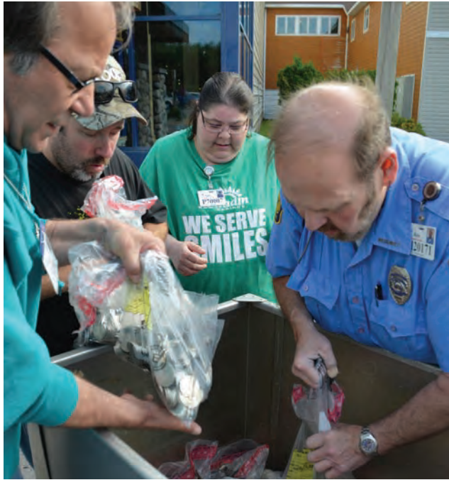
Casino employees emptying bags of tokens into a cart.