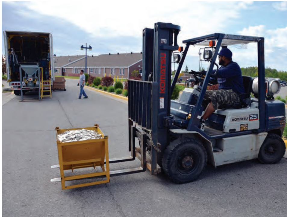
A worker from Secure Mobile Destruction takes a bin full of tokens to the back of the semi where their equipment is set up to destroy the tokens.