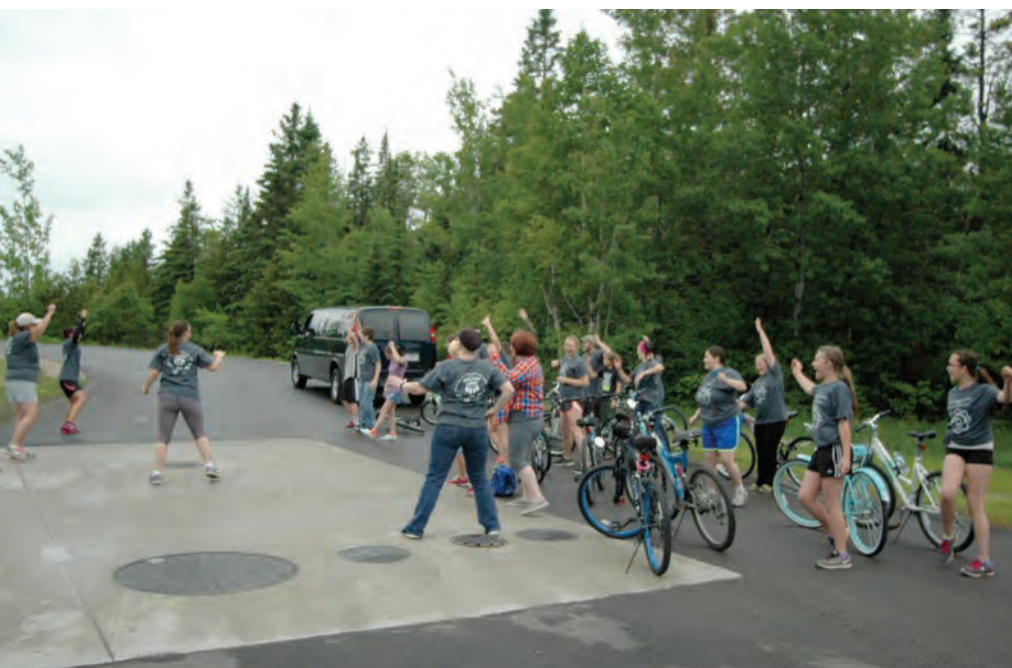
Sault Tribe Youth Education and Activities coordinators coach riders through some warm-up exercises prior to departing St. Ignace.