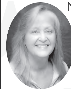
Chief Deputy County Clerk for 28 years

As Mackinac County Clerk, I will always keep in mind that I work for you, the taxpayers and citizens of the County. With my 28 years as Mackinac County Chief Deputy Clerk and my motivation, I am best qualified to be your next County Clerk.